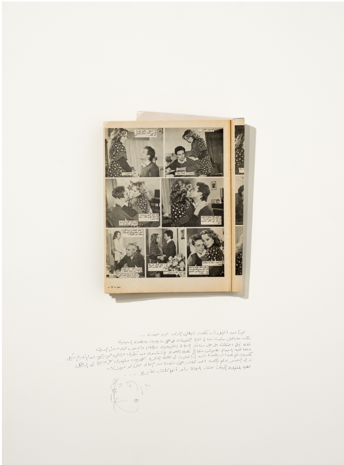
Ayman Yossri Daydban, Al Qablah Al Oola (The First Kiss) , 2014, Arabic comic on acid free paper, 77 x 56 cm