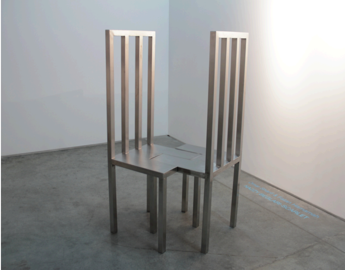
Hazem Harb, Forever , 2013, stainless steel, 150 x 50 x 50 cm.