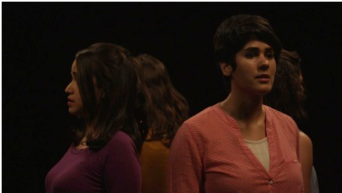
Doa Aly, Hysterical Choir Of The Frightened (HCF) , 2014, 4K transferred to full HD, single channel video projection, 3"51