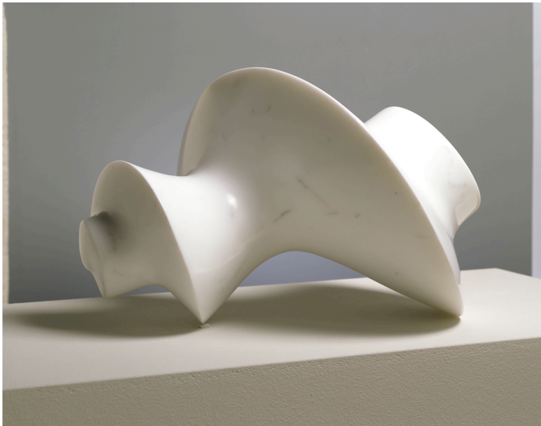
Akiko Sato, Versteinerte Welle – Weiss , 1994/1995 Marmor Statuario 43 x 65 x 45 cm Courtesy Galerie Kashya Hildebrand and Akiko Sato