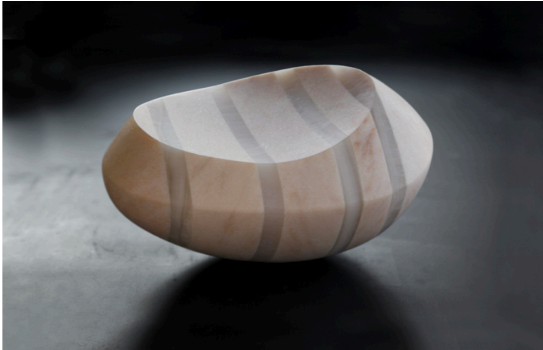
Akiko Sato, Glückliche Erinnerungen (Happy Memories) , 2000 Onyx/Marmor Rosa Portogallo 24 x 38 x 30 cm Courtesy Galerie Kashya Hildebrand and Akiko Sato