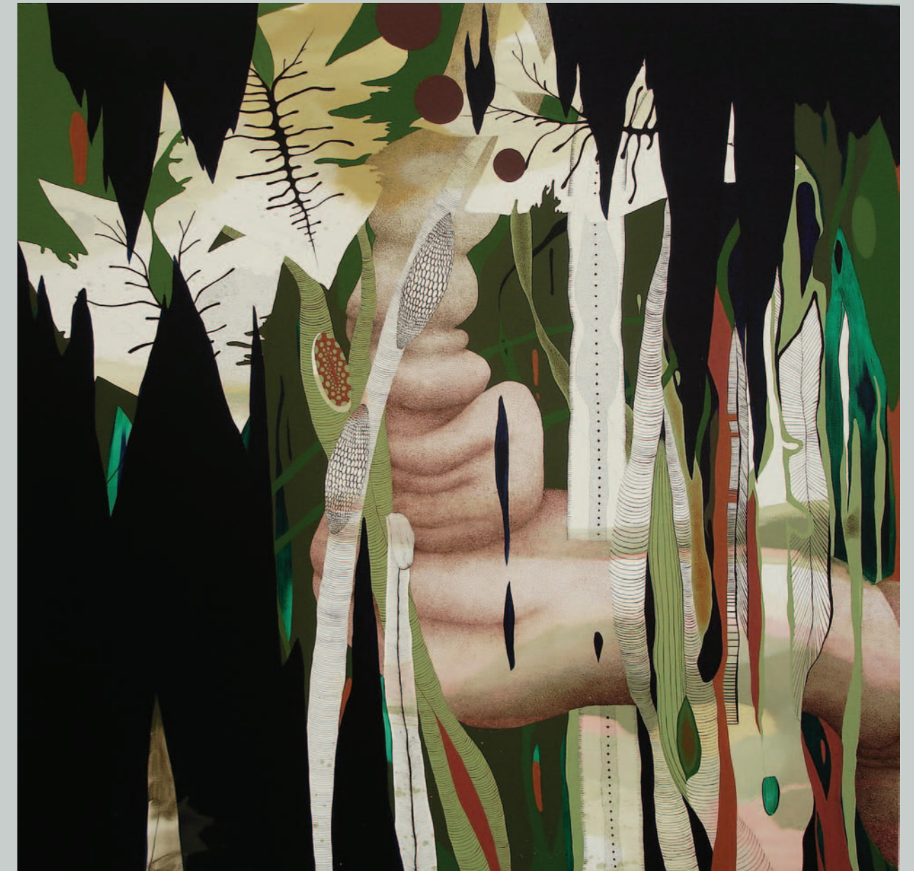
LA FORÊT | 150 X 150 CM | ACRYLIC ON CANVAS | 2006