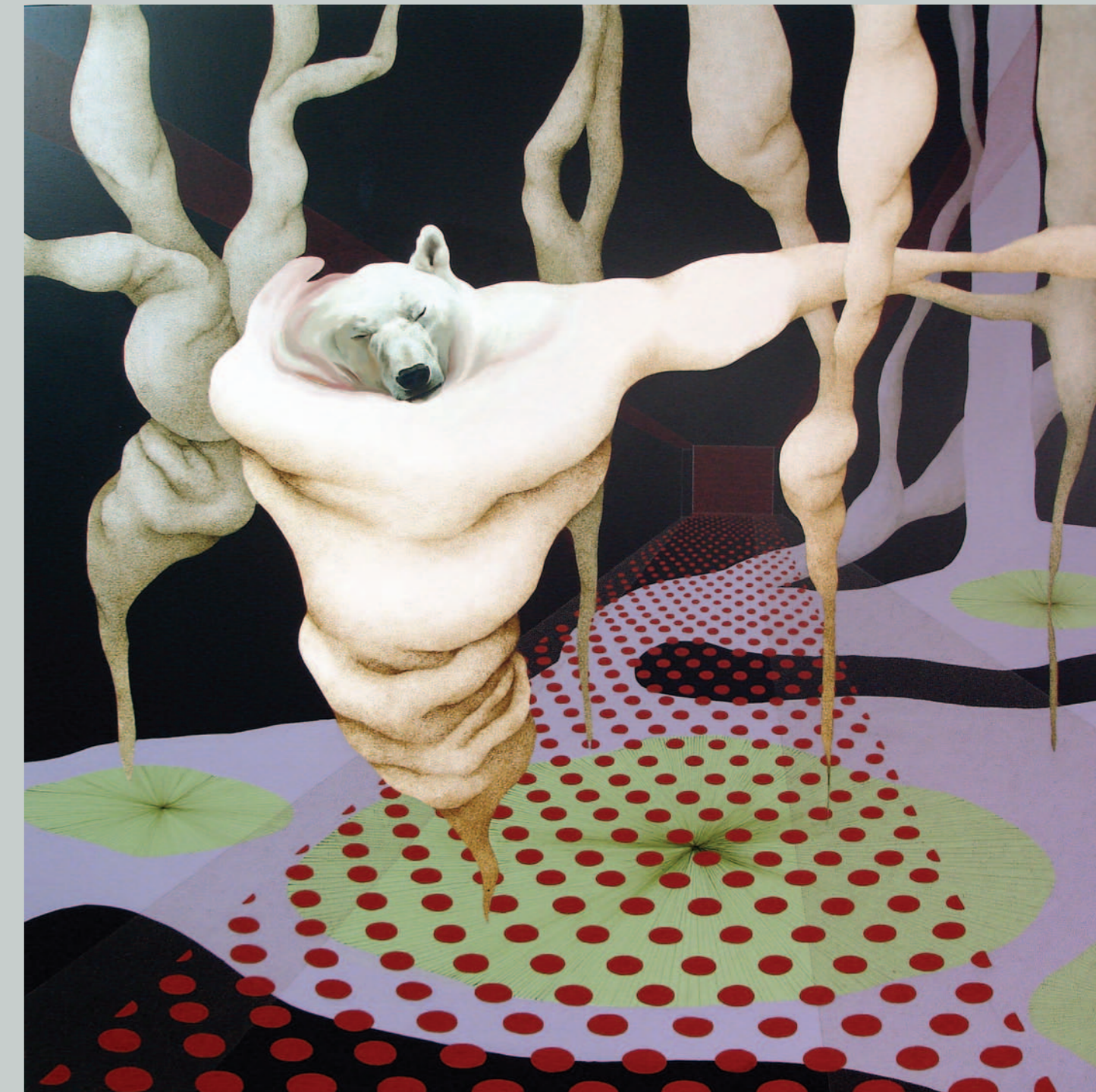
METAMORPHOSE | 150 X 150 CM | ACRYLIC ON CANVAS | 2006

This may very well be a reflection of my background. Born in Korea – a divided country – I live in France, and feel as if I exist between two worlds. In my daily life, I often serve as a link of sorts between members of the Korean community and other groups, and somehow, this interesting condition also reveals another reality: the sensation of placelessness. That feeling has made its way into my paintings regardless of my intentions.