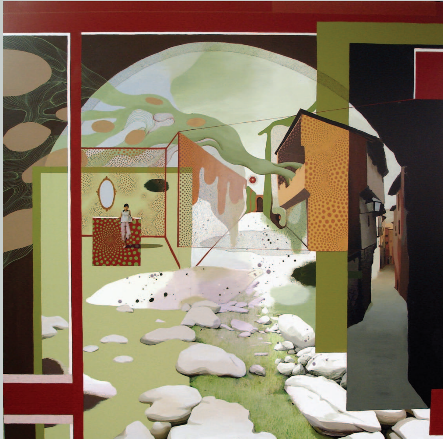
MAISON D'UNE FILLE CAPRICIEUSE | 130 X 130 CM | ACRYLIC ON CANVAS | 2006