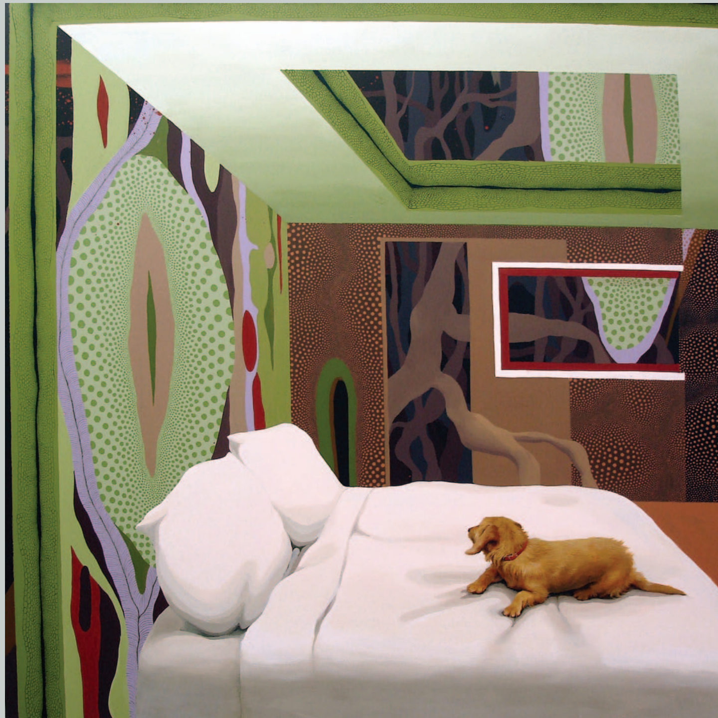
QUAND VA-T-IL ARRIVER | 150 X 150 CM | 2006