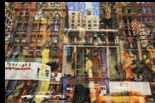
Ta Bom Ties | 53" x 80" | Edition of 5 | 2003 Digital chromogenic print