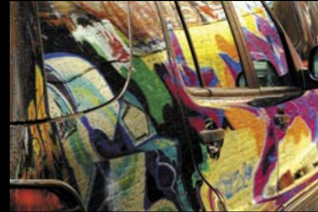
Dinos Parking Garage | 40" x 60" | Edition of 5 | 2002 Archival giclée print

scrutinized. And, while the work speaks of this city and its inhabitants, it is also a personal diary or visual account of Aaronson's own daily discoveries.