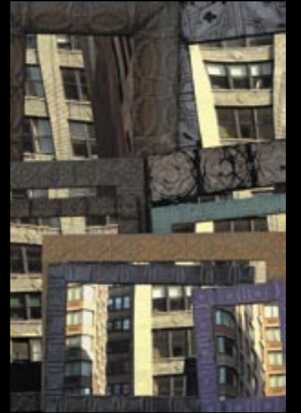
Chelsea Flea Market | 42" x 28" | Edition of 5 | 2002 Archival giclée print

Garage the familiar Day-Glo palette of graffiti conforms to the undulating curves of a black Mercedes that glistens in the aftermath of a light rain shower.