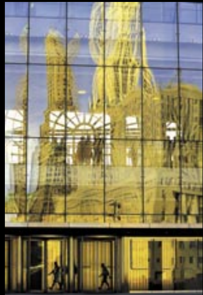
Winter Garden | 60" x 40" | Edition of 5 | 2002 Archival giclée print

His perambulations have taken him from east to west and from lower Manhattan to midtown. As the cityscape passes before him, a multi-layered portrait of the City emerges — from the elegant windows of Bergdorf's, Prada and Saks to a crowded souvenir shop in Times Square. Here, in the faces of people frozen within his reflected scenes, are fragmented, chance narratives of rich and poor, contentment and desire, anxiety, alienation, and vulnerability. In Bus Shelter , a young woman in a print ad averts her eyes from view. Reflections in her head swarm with images from the street — car lights twinkle on her cheek, a bicycle rider veers towards her mouth and a "Get Paid Cash" sign with its tear-off tabs flapping is both an emblem of the indomitable spirit of entrepreneurship and a symbol of economic uncertainty.