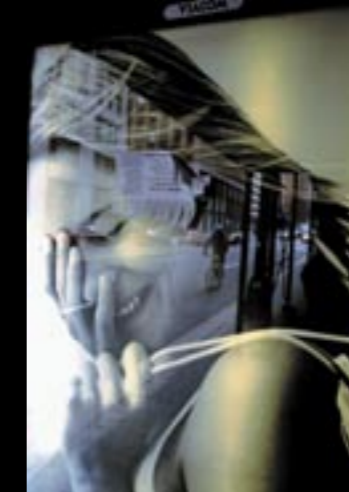
Bus Shelter | 42" x 28" | Edition of 5 | 2002 Archival giclée print

Among Aaronson's most compelling images are those in which reality is obscured by pattern and abstraction supercedes the concrete. Framed mirrors in Chelsea Flea Market bring nearby buildings into close view, conflating the monumental and the intimate. Similarly, Ta Bom Ties fuses reflected architectural detail with a multitude of richly patterned ties, which become one with bricks, doors, windows, and sky. In Dino's Parking