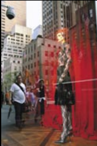
Saks | 42" x 28" | Edition of 5 | 2002 Archival giclée print

Jeffrey Aaronson's recent series of color photographs of reflections — shot on the streets of New York and printed by his own hand without digital manipulation — offers a rich bounty of unexpected surprises and a fresh vision of the city. For the past two years he has