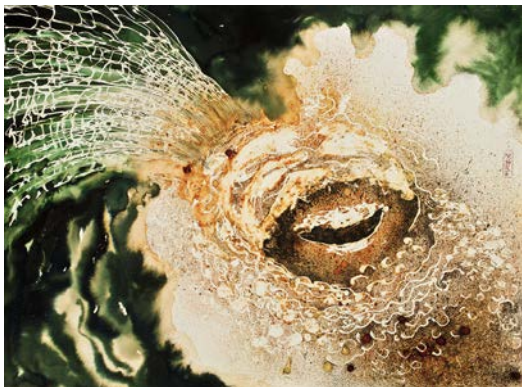
Igneous Flux , 2010, 56 x 76 cm, ink on paper