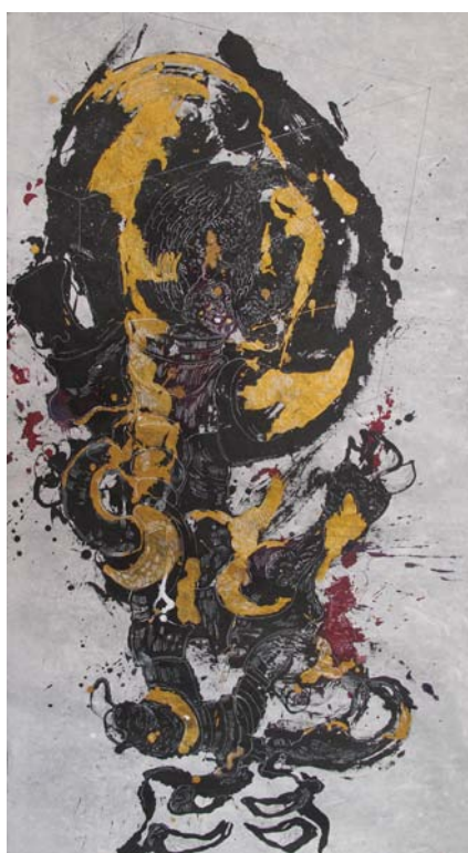
The Wolf Is Crying like a Child , 2011, 145 x 75 cm, mixed media on paper