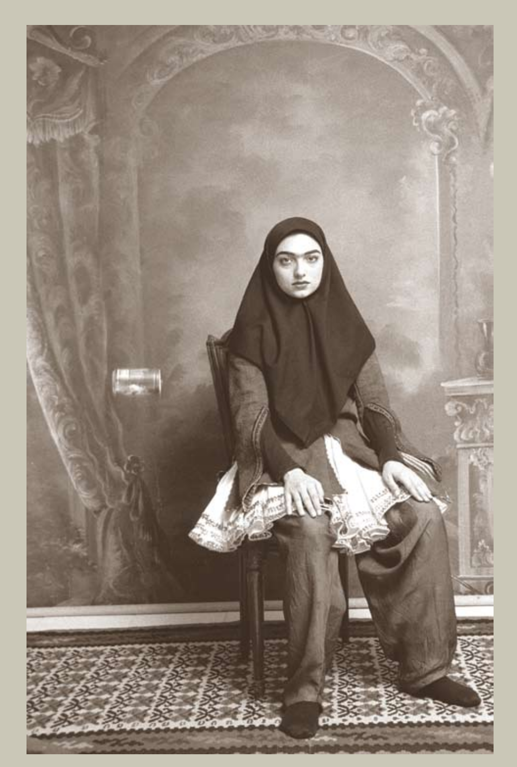
QAJAR SERIES | 90 X 60 CM | COLOR PHOTOGRAPHIC PAPER | EDITION OF 10 | 2001