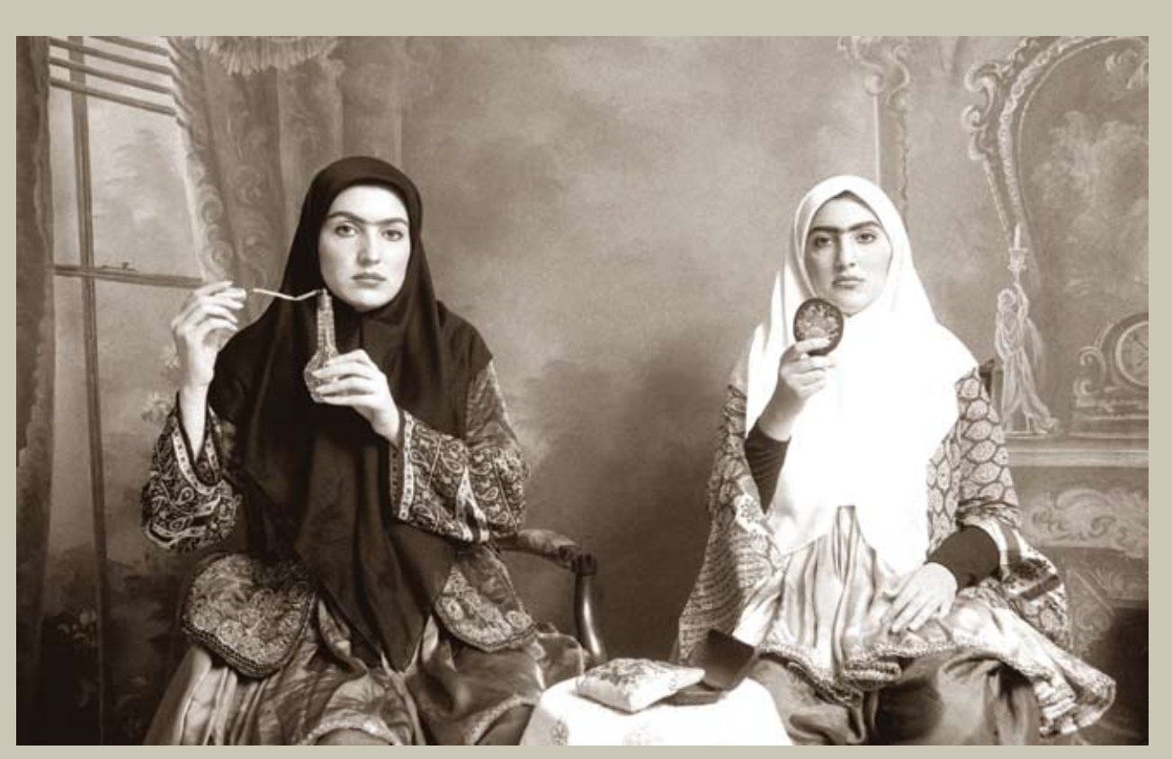
QAJAR SERIES | 90 X 60 CM | COLOR PHOTOGRAPHIC PAPER | EDITION OF 10 | 200