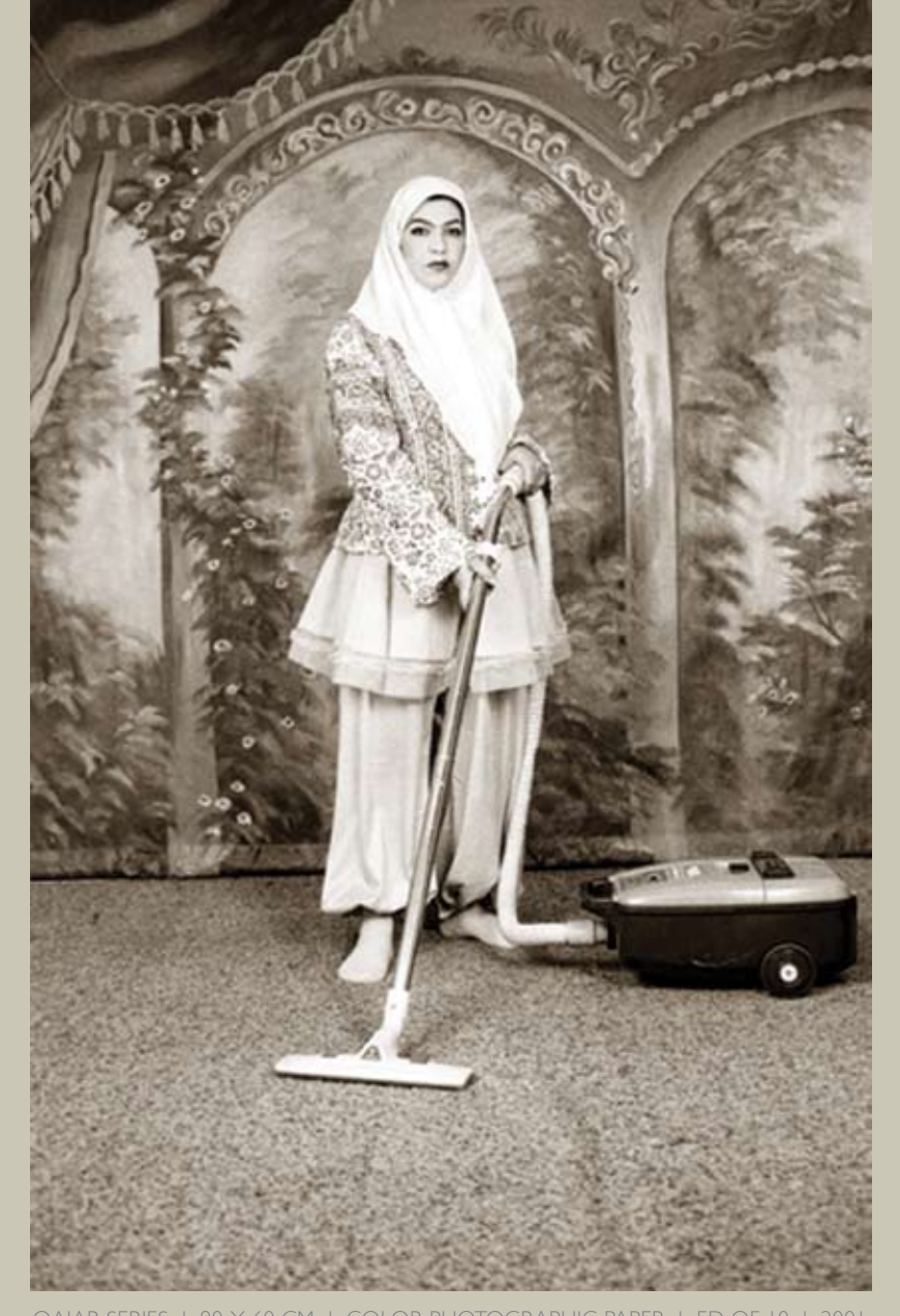
Qajar series | 90 x 60 cm | Color Photographic paper | ed 0f 10 | 2001

info@kashyahildebrand.org www.kashyahildebrand.org