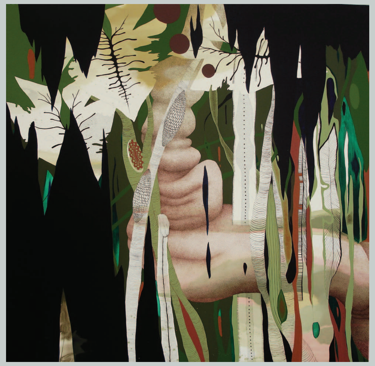
LA FORÊT | 150 X 150 CM | ACRYLIC ON CANVAS | 2006