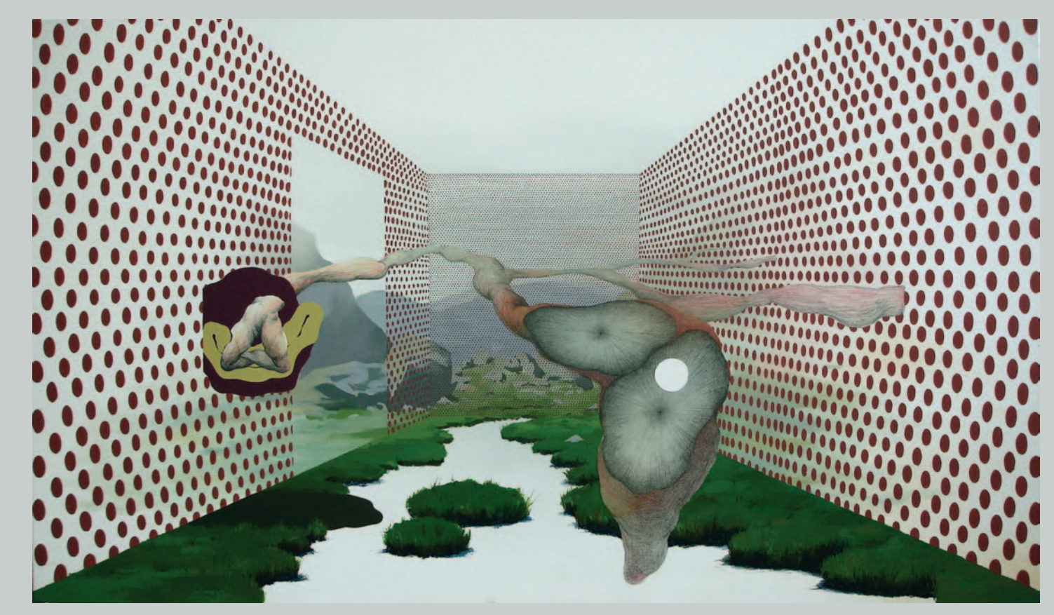
UNTITLED | 139 X 200 CM | ACRYLIC ON CANVAS | 2006

The main characteristic of my works is a type of duality which finds many ways of expressing itself: abstraction versus realism, ubiquity, diachronicity, microscopic versus macroscopic, and so on. I'm always trying to engage in extreme or contrary dialogue. In abstract compositions, hyperrealistic figures urge you to define clearly articulated space. However, you will still wonder as to whether or not it has to be viewed from that perspective, because something flat will always play tricks with one's perceptions. Somehow, you will feel as if you are hanging between two worlds.