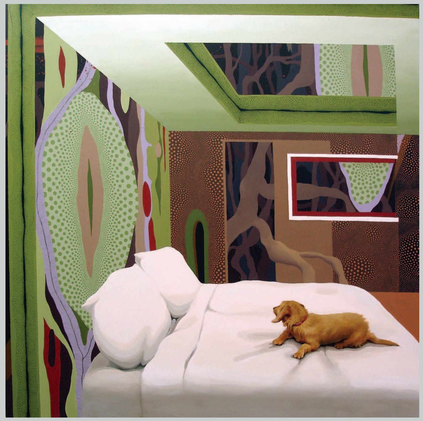
QUAND VA-T-IL ARRIVER | 150 X 150 CM | 2006