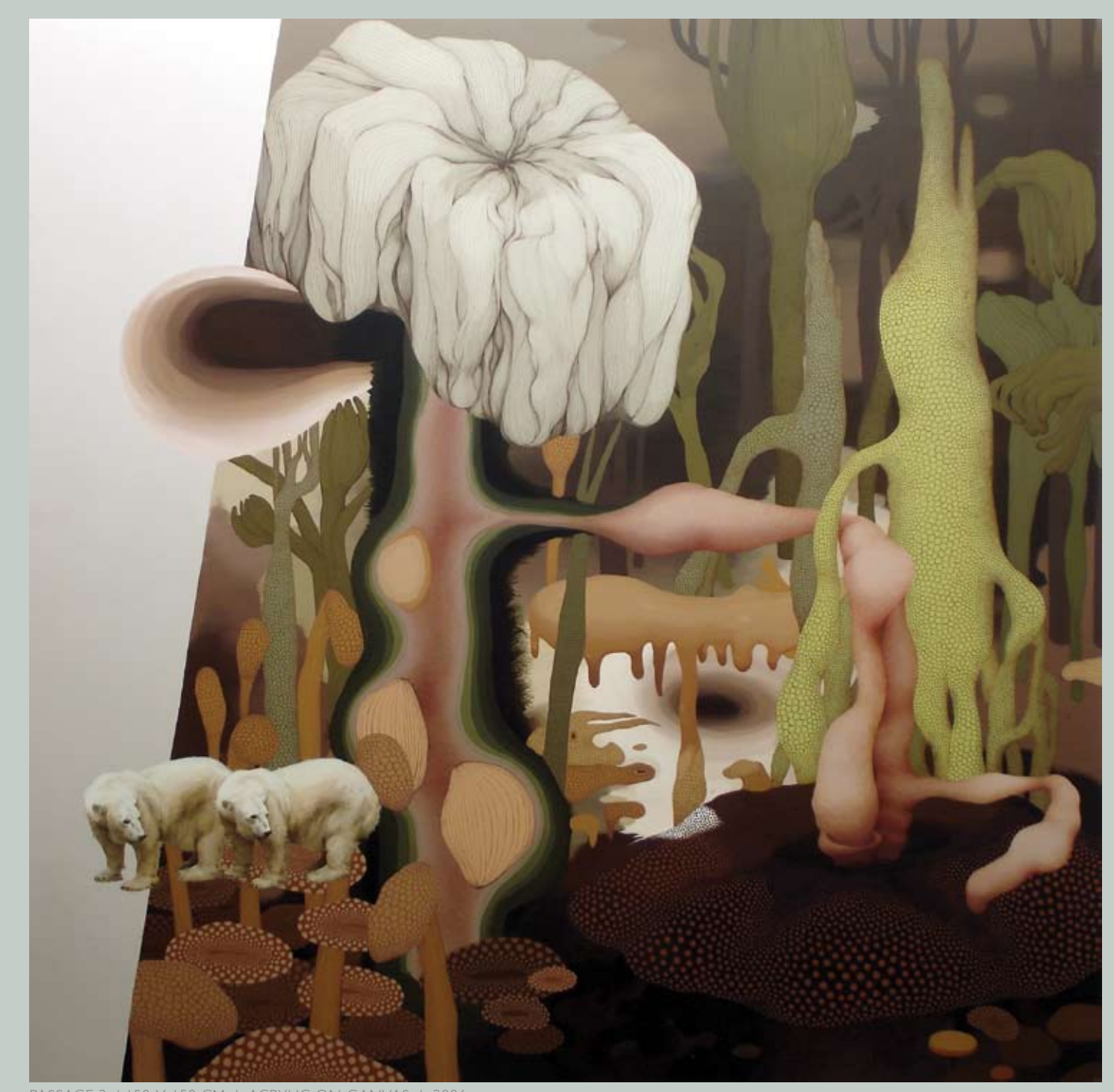
PASSAGE 3 | 150 X 150 CM | ACRYLIC ON CANVAS | 2006