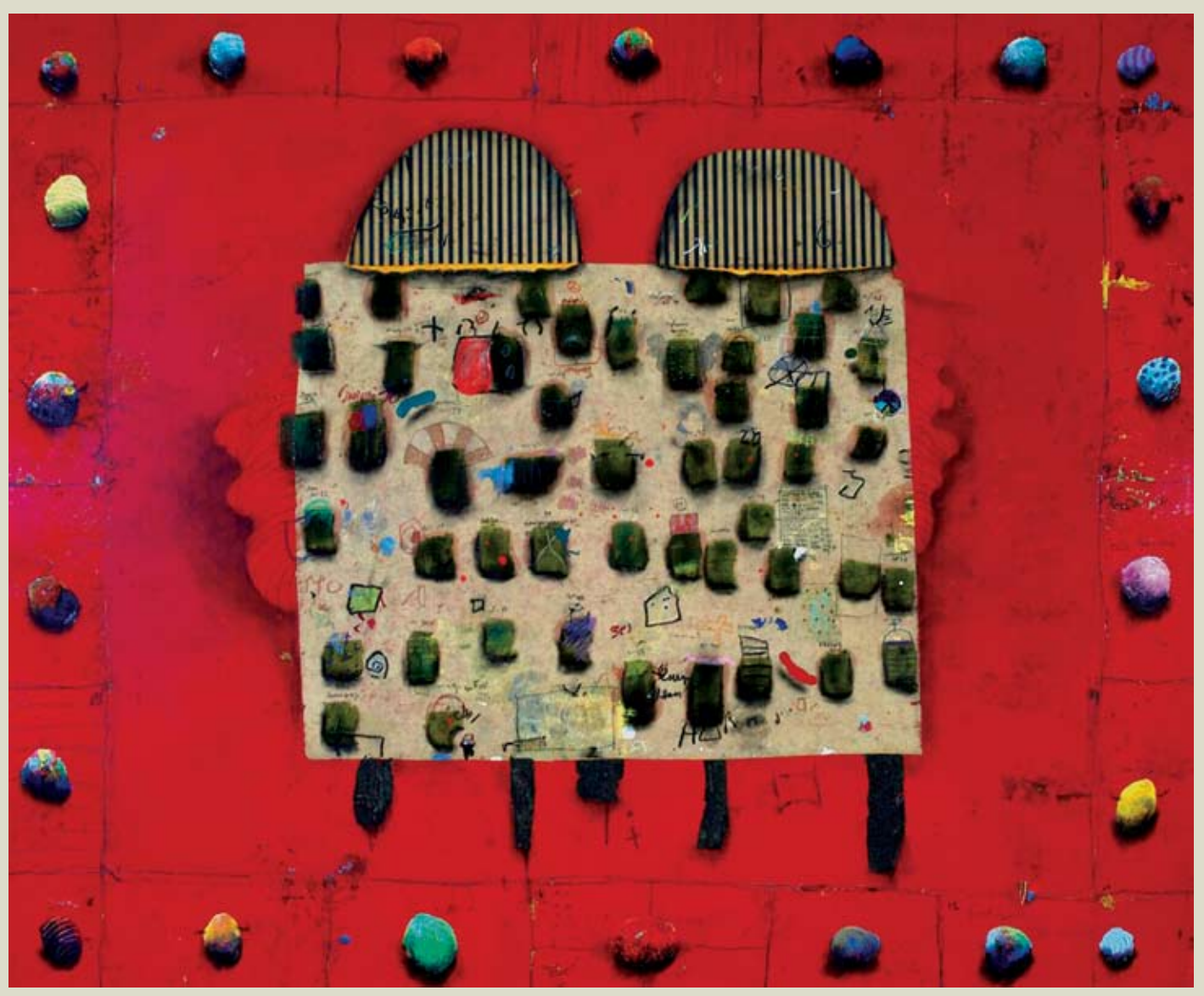
2 AS I | 100 X 130 CM | MIXED MEDIA ON CANVAS | 2006