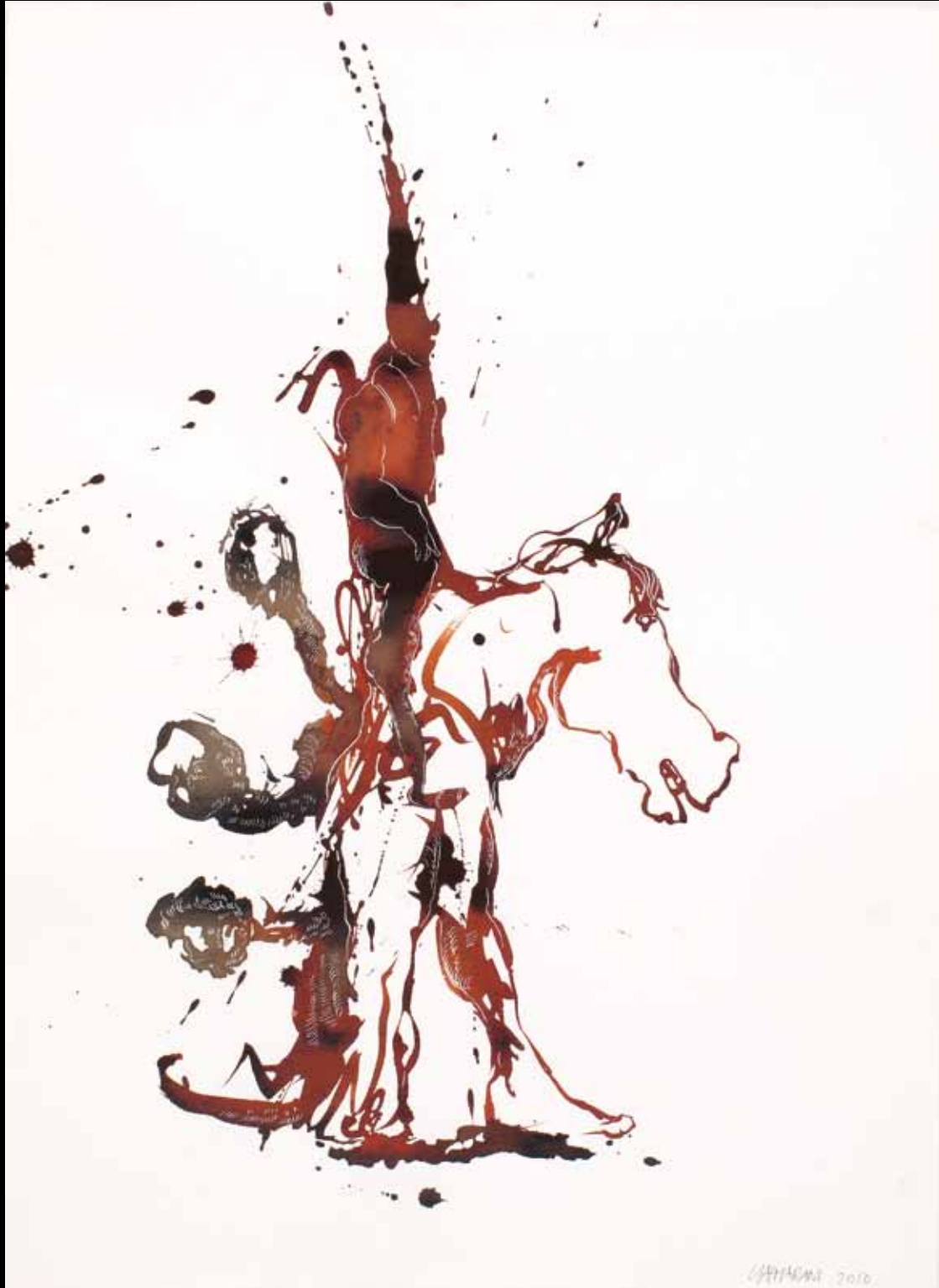
Study For A Sculpture 5 2010 ink on paper 75 x 50 cm