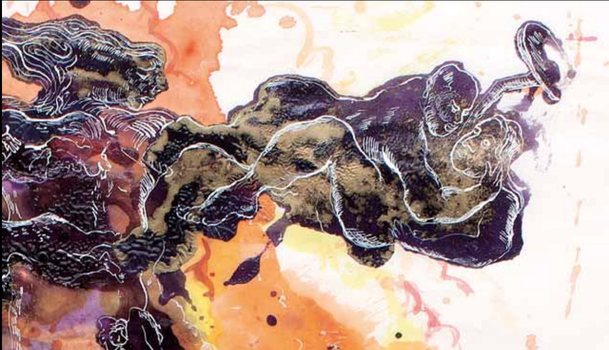
How Many Times He Did That! (Detail)

How Many Times He Did That! 2011 mixed media on paper 145 x 75 cm