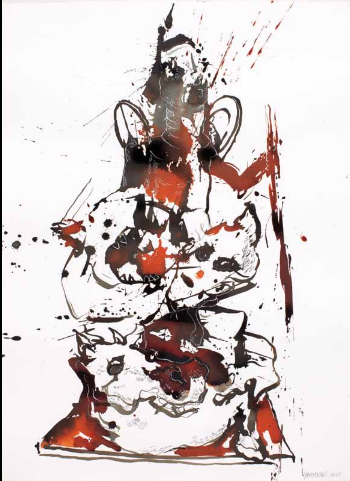
Study For A Sculpture 2 2010 ink on paper 75 x 50 cm