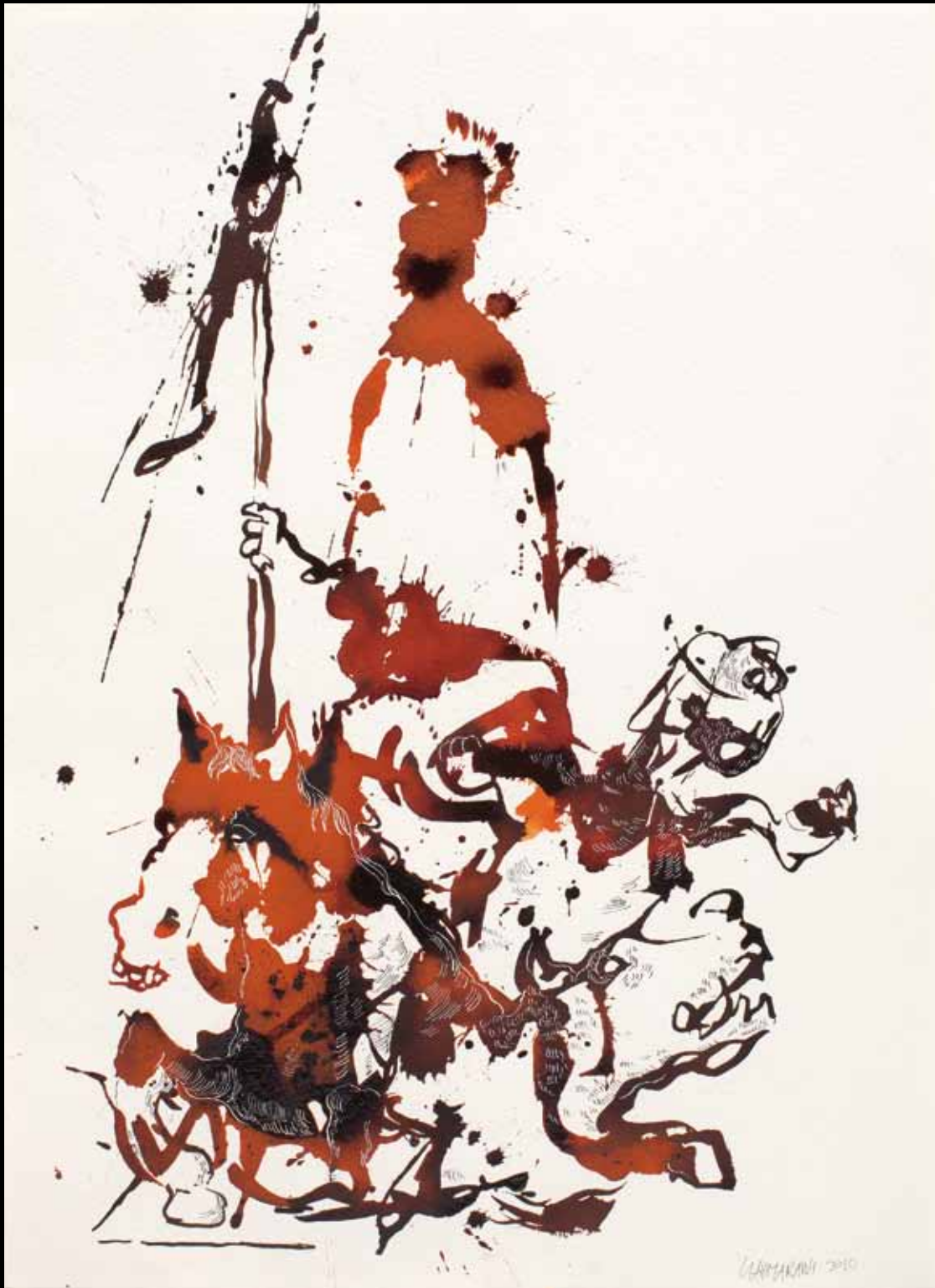
Study For A Sculpture I 2010 ink on paper 75 x 50 cm