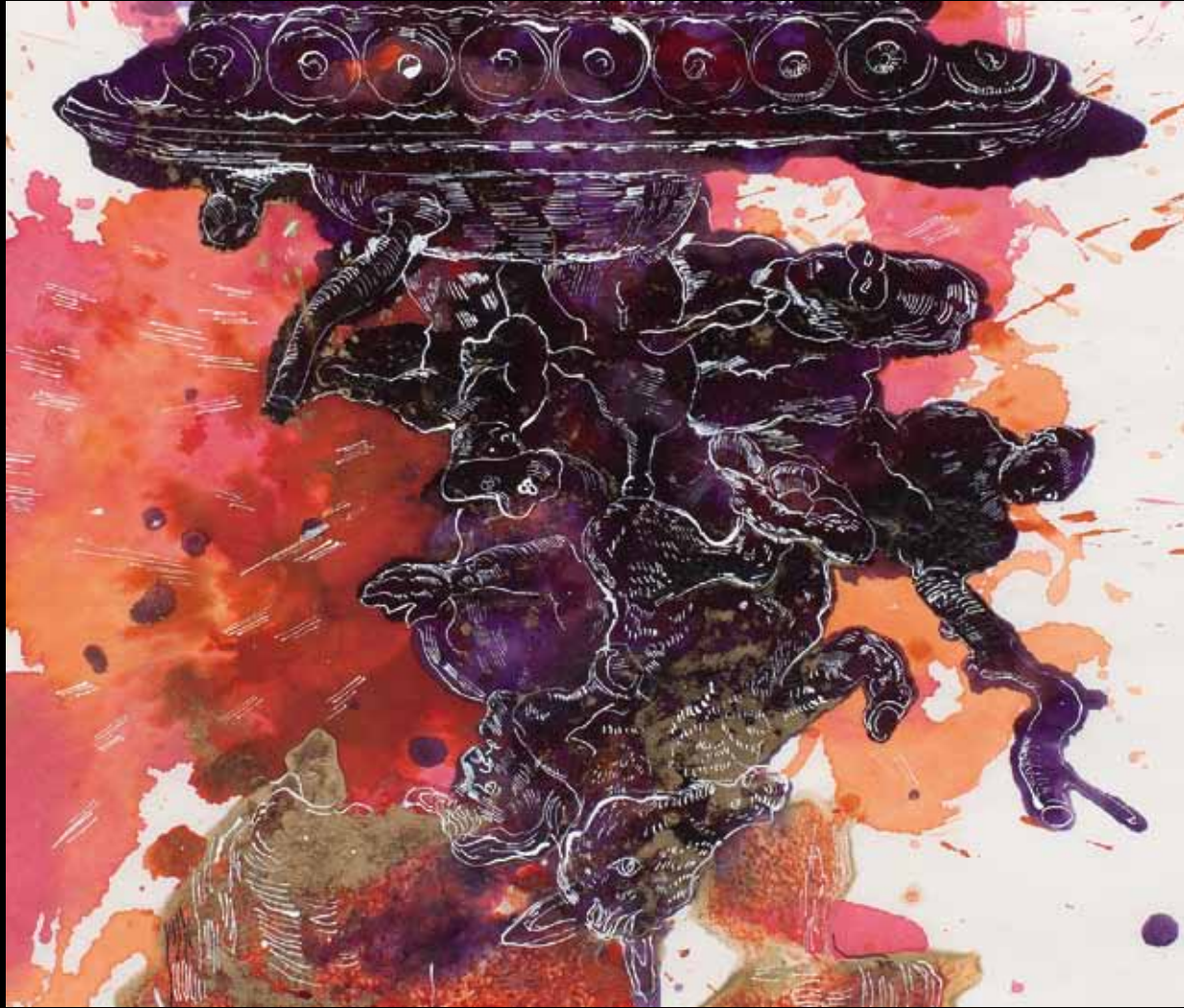
Blue As Your Blood (Detail)

Blue As Your Blood 2011 mixed media on paper 145 x 75 cm