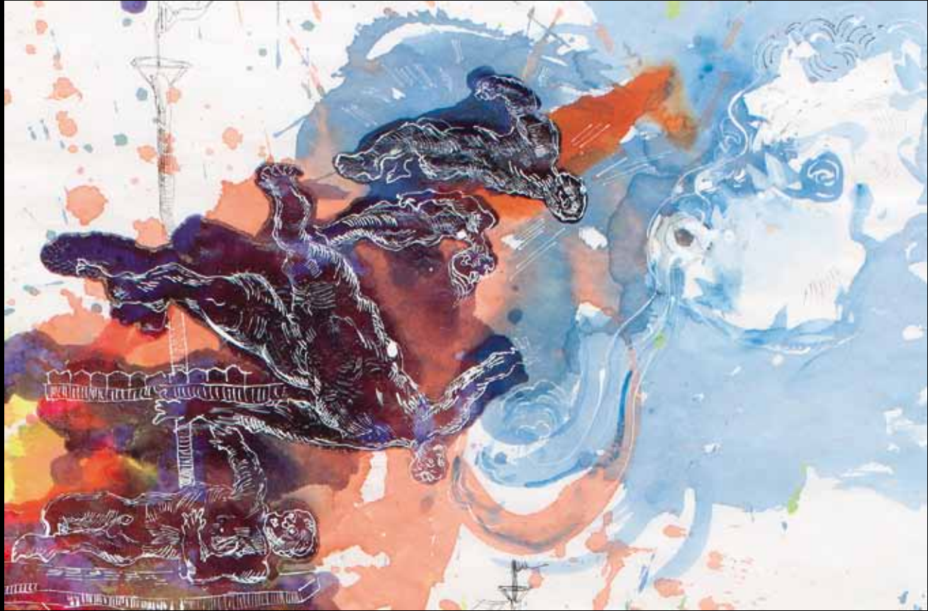
There Is Always A Mystery (Detail)

There Is Always A Mystery 2011 mixed media on paper 145 x 75 cm