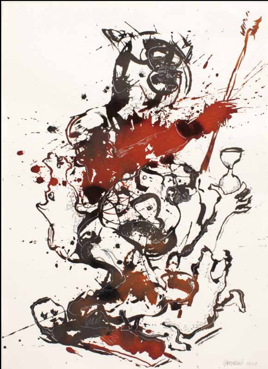
Study For A Sculpture 3 2010 ink on paper 75 x 50 cm